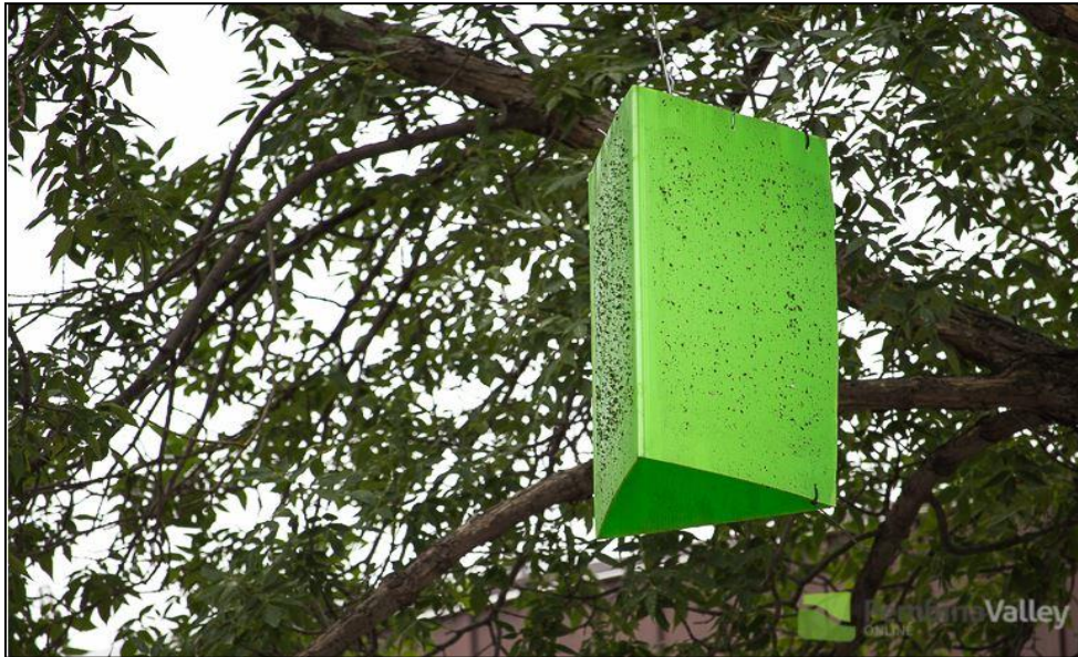
Example of an Emerald Ash Borer Canopy Trap

Carter is currently working on a report which details the methodology and results of the project, but initial trapping efforts resulted in fifty (50) EAB beetles being caught by canopy traps throughout Bay County this summer. This data proves the lingering presence of EAB throughout Bay County and supports the need for continued treatment of publicly owned critically endangered ash trees in order for them to continue to thrive and grow, providing value in many forms to local residents.